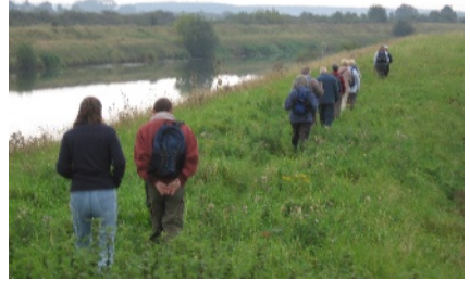
Dunston Fen - Sept 08

The walking group was started as one of the first groups of Heath U3A branch. Over 20 people attended the inaugural meeting in early August 2008 and it became apparent that there was a half and half split between attendees who preferred shorter walks and the rest who were in favour of walks of 6 miles or more; so from this point we have had the