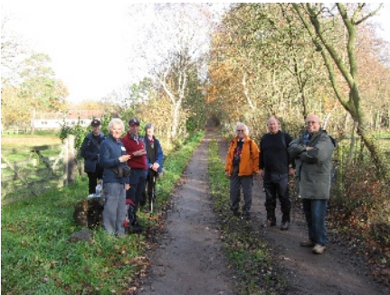
Skellingthorpe woods - Nov 08